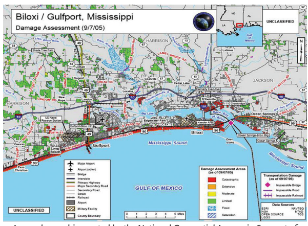
A sample graphic created by the National Geospatial Agency in Support of Hurricane Katrina relief efforts

IMINT played the largest role in helping tailor response efforts. Most of the contributing organizations provided images, maps, full motion video and terrain analyses that were used to create damage assessments and monitor the affected areas for stranded survivors and potential dangers. NGA had begun imaging critical infrastructure, such as roads and ports, around the Gulf of Mexico prior to the hurricane hitting.<sup>4</sup> It also pre-deployed teams of analysts and systems experts to the Gulf Coast region, which enabled the creation of the first holistic damage assessment after the hurricane struck.<sup>5</sup>